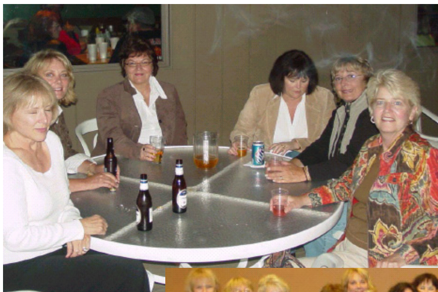
The ceremonial "Drowning of the Sorrows" began at Mulligan's Pub with this crowd of partiers.