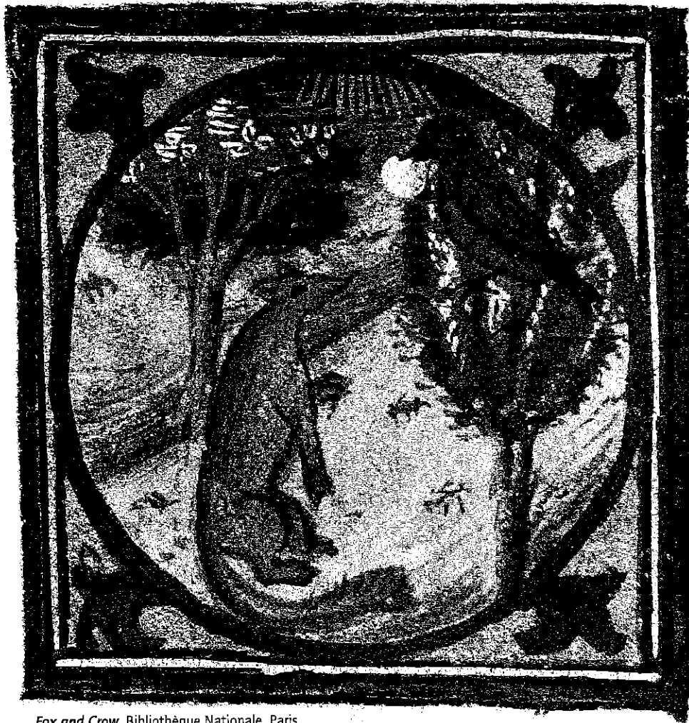
Fox and Crow. Bibliothèque Nationale, Paris.