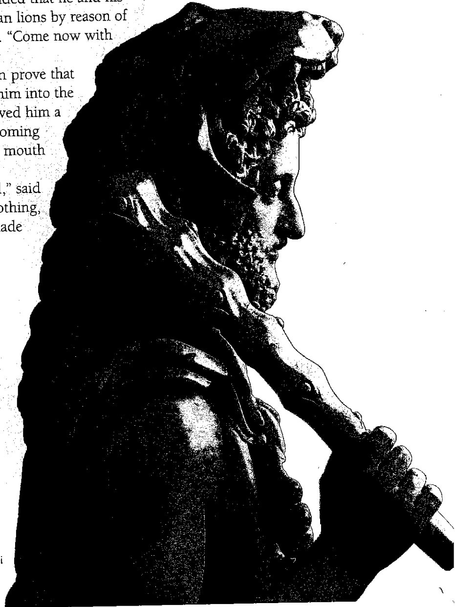
Emperor Commodus as Hercules, AD 191-192. Unknown artist. Musei Capitolini, Rome.

"That is all very well," said the Lion, "but proves nothing, for it was a man who made the statue." ♣